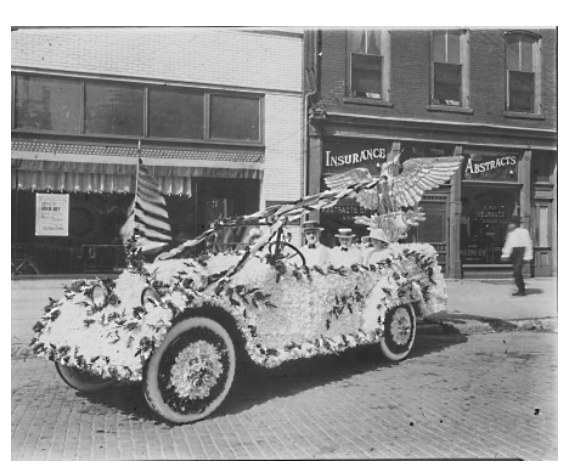
Unknown Entrants During the WWI War Years