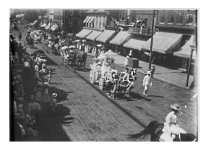
Flower Parade on High Street, Jefferson City