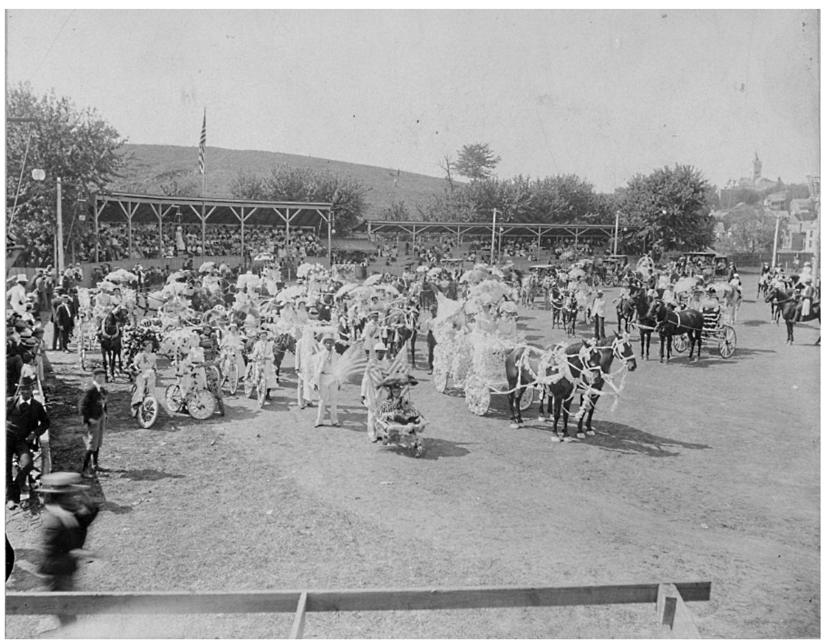
Cottage Place Park, Assembling for Flower Parade

The parade attracting the most admiration was the "Flower Parade", presented under the auspices of the ladies of Jefferson City. The grounds of "Cottage Place Park", which lay on the west side of Lafayette Street, between McCarty and Miller Streets, was particularly well adapted to events of this kind. The land upon which it lay was low and flat and very close to the streets of the business district of Jefferson City of the late 1890's and early 1900's. The proximity to the business district placed the park as a special gathering place for the parade of horse drawn vehicles down High Street and equally well suited for disassembly following the parade.