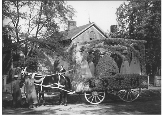
Unknown Entrants in the Flower Parade