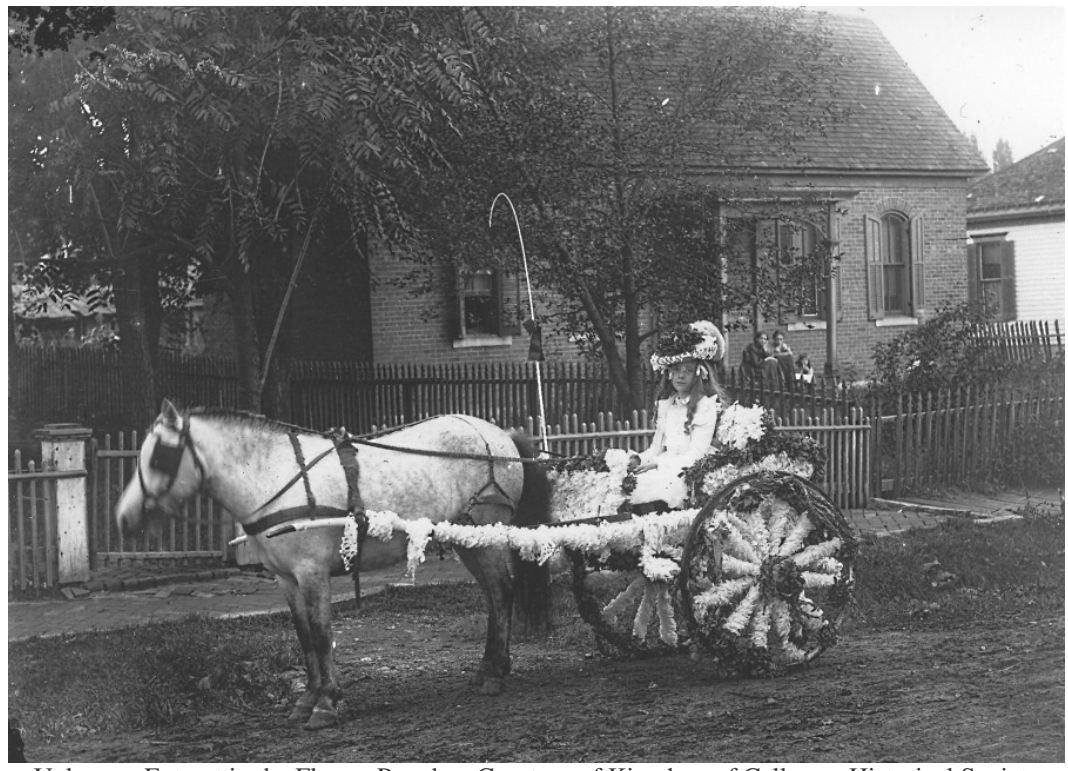
Unknown Entrant in the Flower Parade

By 1900 and for many years thereafter, at least forty vehicles were in line and each vied with the other in beauty of design and decoration. The parade was recognized by visitors as comparing favorably with those of larger cities and many compliments were bestowed on the ladies for their taste in the decoration of handsome turnouts.